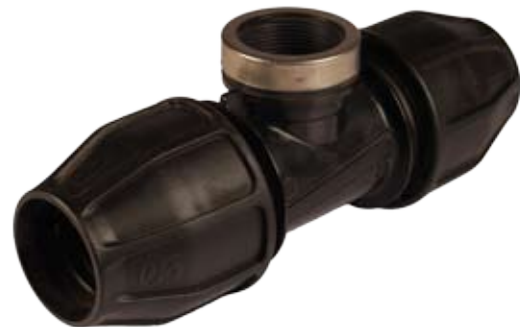
Female Iron Tees 16mm x 1/2" to 110mm x 4"