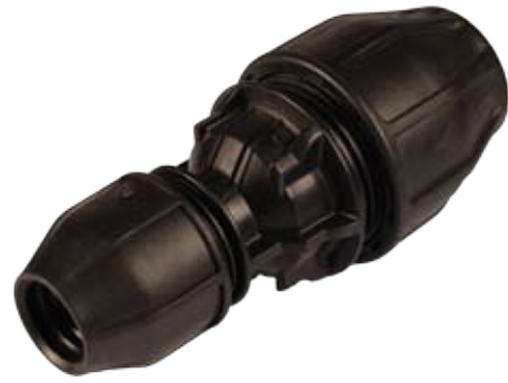
Reducing Couplings 20mm x 16mm to 110mm x 90mm