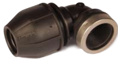
90° Female Elbows 16mm x 1/2" to 110mm x 4"