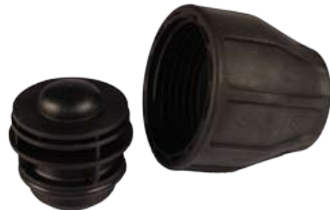
Blanking Plug set 20mm to 63mm