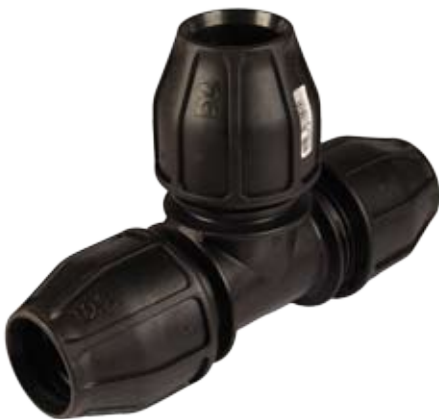
Equal Tees 16mm to 110mm Slip Tees 20mm to 63mm