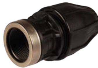
Female Adaptors 16mm x 1/2" to 110mm x 4"