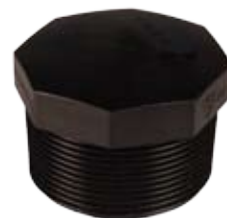
Threaded BSP Plug End 20mm x 15mm - 3/4" x 1/2" to 50mm x 40mm - 2" x 1 1/2"