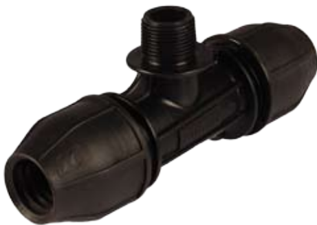
Male Iron Tees 25mm x 1/2" and 25mm x 3/4"