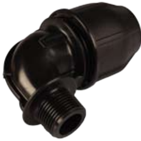
90° Male Elbows 25mm x 3/4" and 32mm x 1"