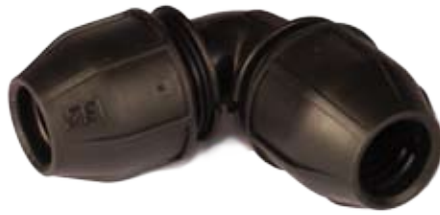
90° Elbows 16mm to 110mm