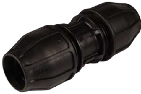
Couplings 16mm to 110mm Slip Couplings 20mm to 63mm