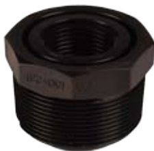
Threaded BSP Bush 15mm x 1/2" to 50mm x 2"