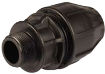
Male Adaptors 16mm x 1/2" to 110mm x 4"