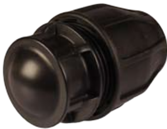
End Caps 16mm to 110mm